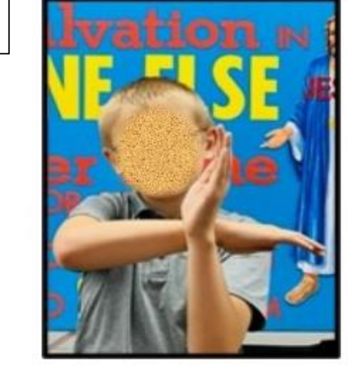
what He has done!